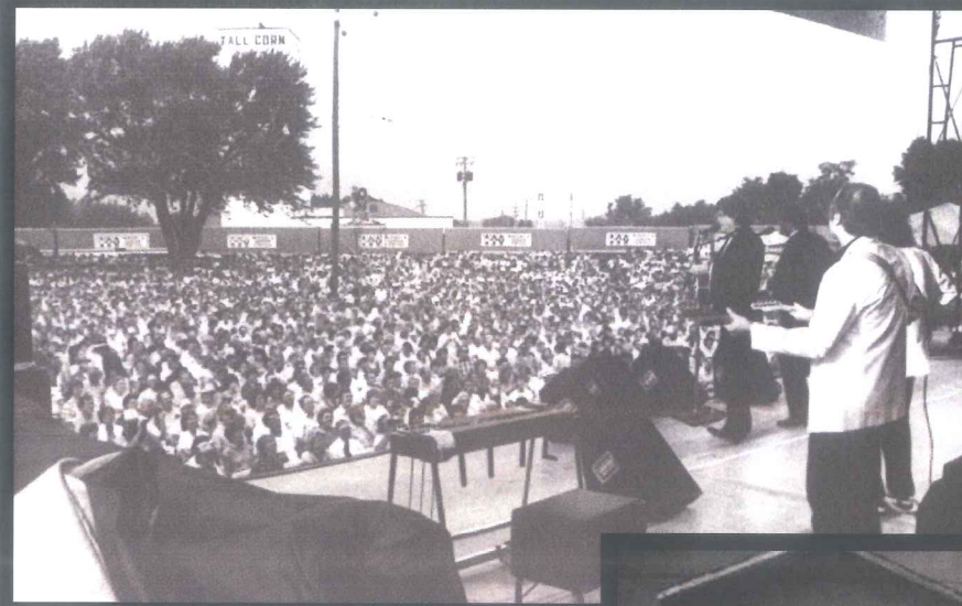
1986 Homecoming concert in Shenandoah